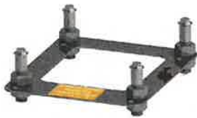
Standard Anchor F-04CAJP