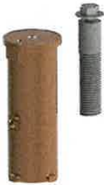
Standard Anchor F-808SA