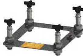
Standard w/Quick Attach Knobs F-046QAB-AT1