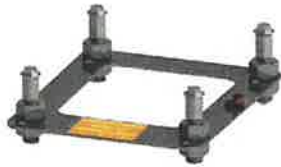
Standard Anchor F-04CAJP