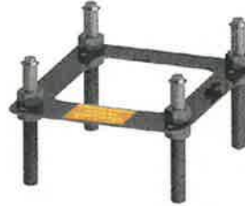
Paver Anchor F-08CAJP