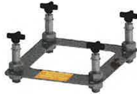
Standard w/Quick Attach Knobs F-046QAB-AT1