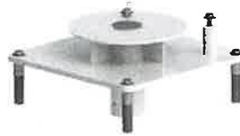
Semi-Recessed Anchor F-77SSA