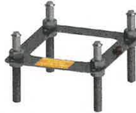
Paver Anchor F-08CAJP